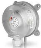
Differential Pressure Switch