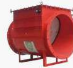
Explosion Isolation Valve