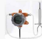
Air Speed Sensor