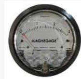
Differential Pressure Gauge