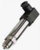
Differential Pressure Transmitter