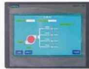
Siemens PLC Touch Screen